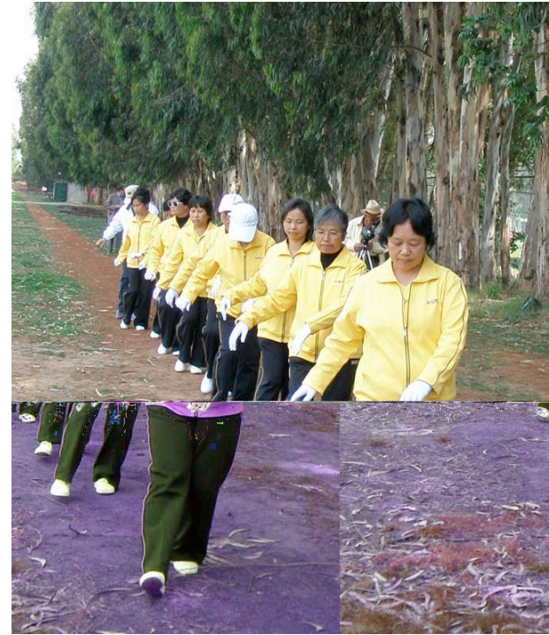
XiXiHu at Cancer Research Center

Please check the China trip link on our Linggui.org website for more pictures and memories of other students (soon to come).